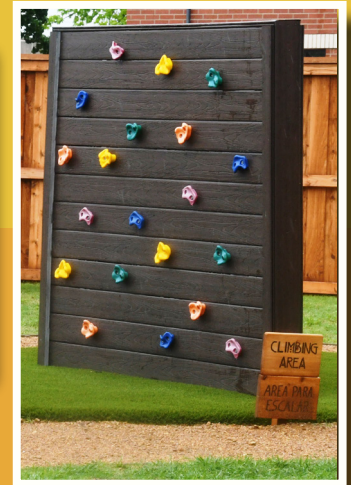
The Outdoor Classroom climbing area. One of the play-and-learn stations.