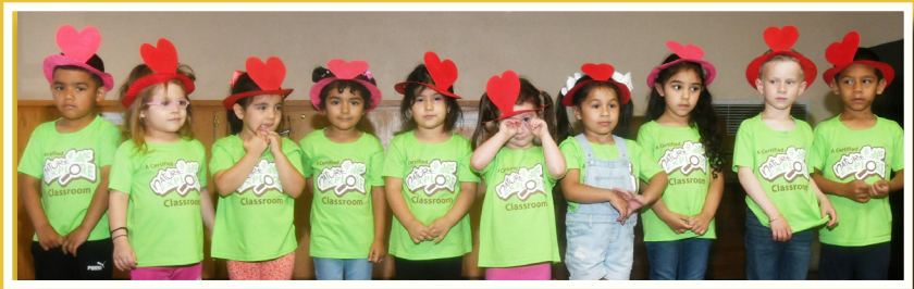
Children from the Tony Reyes Bilingual Child Development Center provided attendees with a super performance before the ribbon cutting.